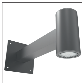
Custom made wall bracket

All current index numbers, lumen outputs, power consumption and many other technical information are available in our 2024 pricelist.